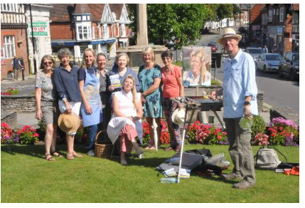
Painting in Town