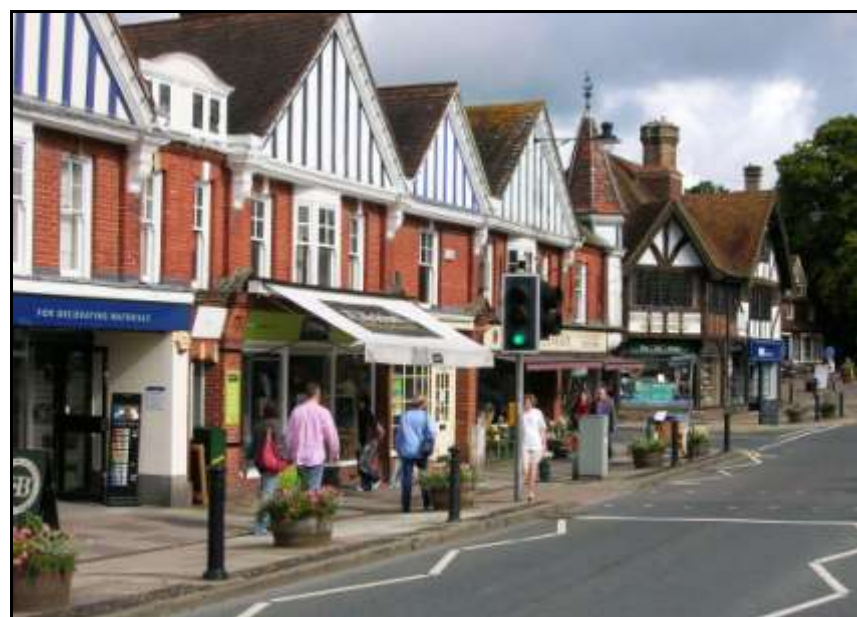
Haslemere High Street