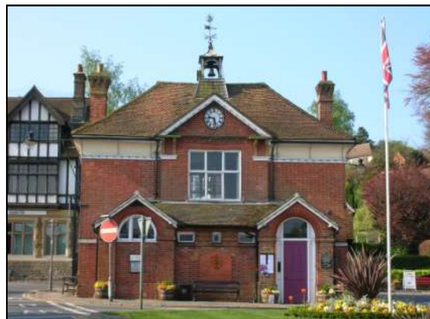
Haslemere Town Hall

Finally, it is hoped that the HDS will be adhered to as a point of reference by all those who have an interest in undertaking any development in the area.