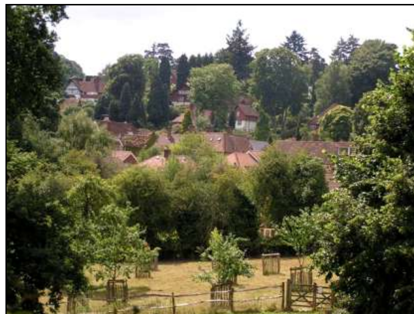
Haslemere from Swan Barn Community Orchard, just a short distance from the High Street, showing how wooded it is close to the town centre