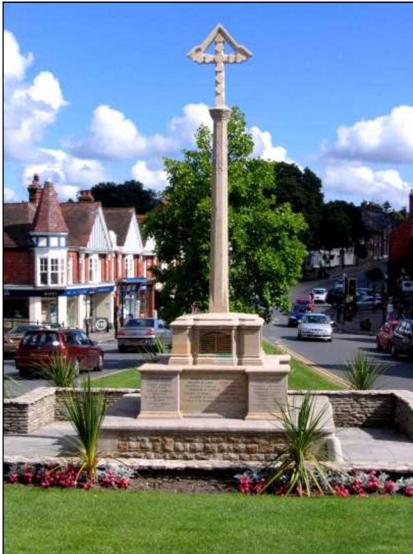
Haslemere War Memorial