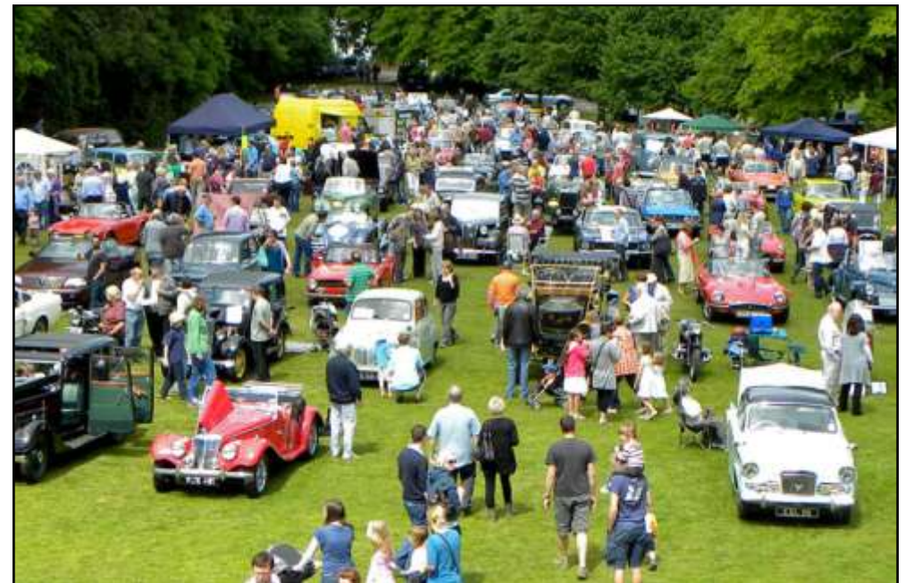
Haslemere Fringe Festival and Classic Car Show 2010, Lion Green