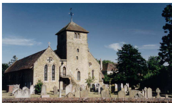
St Bartholomew's Church